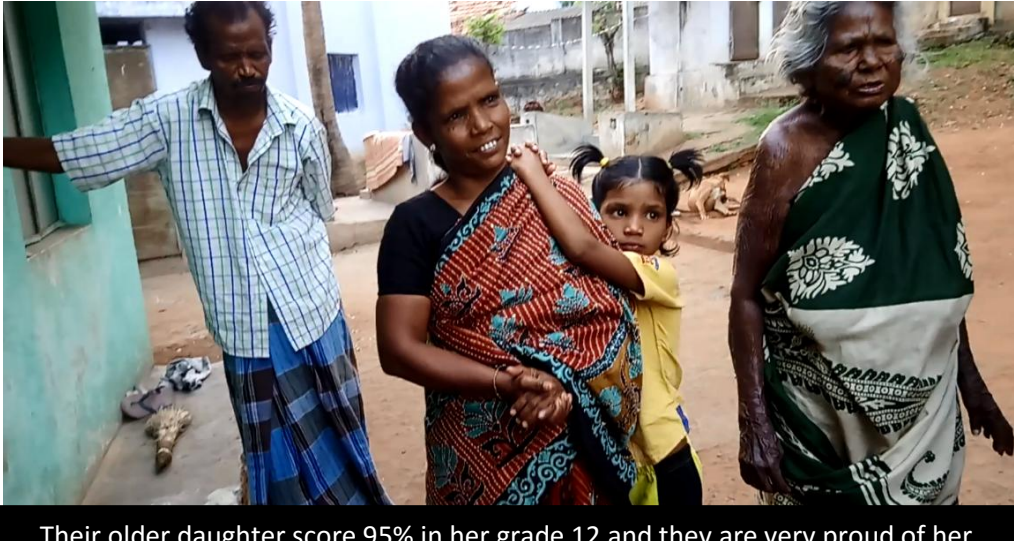
Their older daughter score 95% in her grade 12 and they are very proud of her.