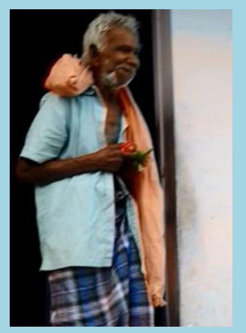
He was cooking with tomatoes in his hands and invited us for a meal